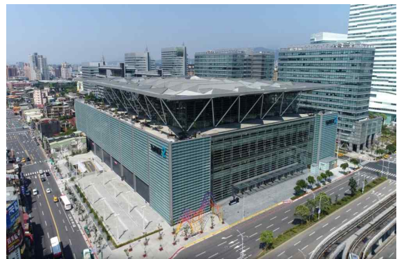
Exterior View of the Venue